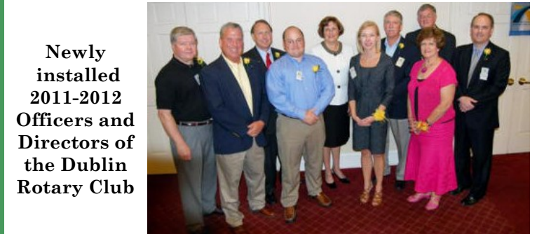
Newly installed 2011-2012 Officers and Directors of the Dublin Rotary Club